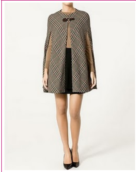
Plaid cape from Zara $129

To cape or not to cape? Too cute or too trendy? Yes to the cape, but no to the plaid? Or, yes please, plaid! Just not on a cape. Ponchos are problematic, though capes can be captivating... Yes? No? No? Yes? Too many questions for just one little red-haired girl. Help, please.